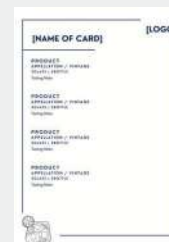
Custom Menu/ Beverage Feature Card